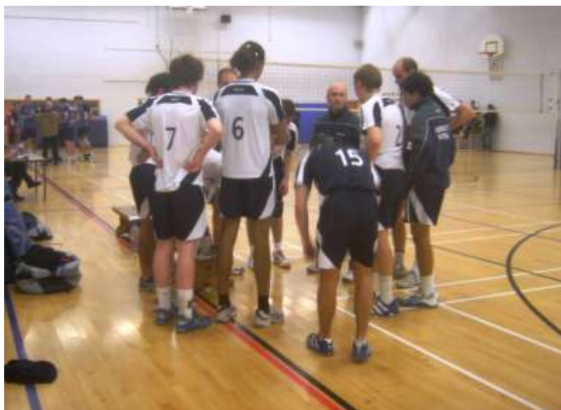
'Castle in time-out action v Sheffield in December 2009

All our NVL teams are responsible for writing their own match reports and submitting them for publication on www.nsvc.co.uk - go to the 'Statistics links on the home page to read the reports