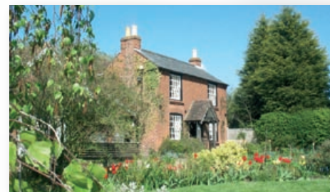
In 2007, the Elgar Birthplace Trust Museum near Worcester is at the heart of celebrations marking the 150th anniversary of the composer's birth – see www.elgarfoundation.org - with visitors also coming to Birmingham, Malvern and various other locations in the region from many parts of the world.

For more information on the work of MLA West Midlands, please click on www.mlavestmidlands.org.uk