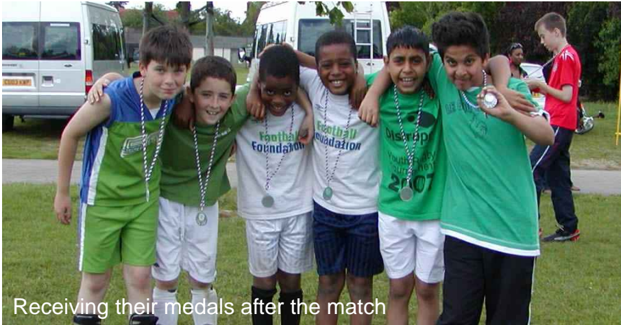
Receiving their medals after the match

Four sports within five localities is the goal of one new StreetGames project.